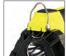
Locking mechanism keeps head in place