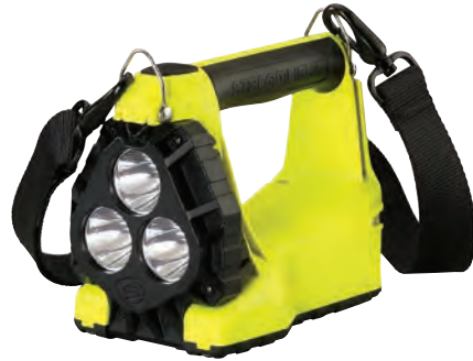
Yellow model includes heavy duty strap Configuration with quick release strap available