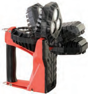
180° articulating head