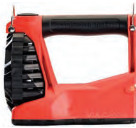
Taillight LEDs ensure you can be seen even from behind Can be programmed on or off