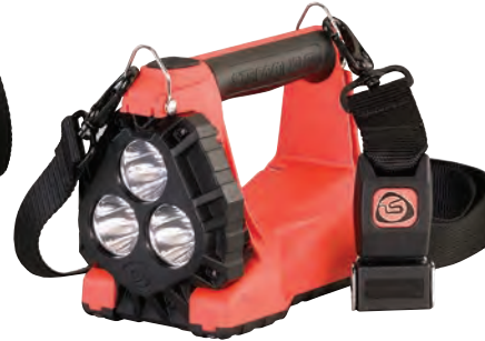
Quick-release strap works like a seatbelt buckle for fast and easy release/connection of shoulder straps